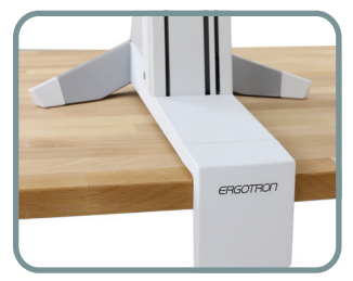
DESK CLAMP ATTACHES TO SURFACE EDGE .47-2.4" (1,2-6 CM) THICK