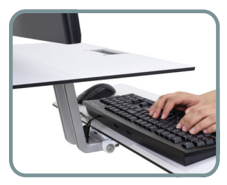
LARGE BACK-TILT KEYBOARD TRAY